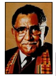
Dr. Joseph Lowery